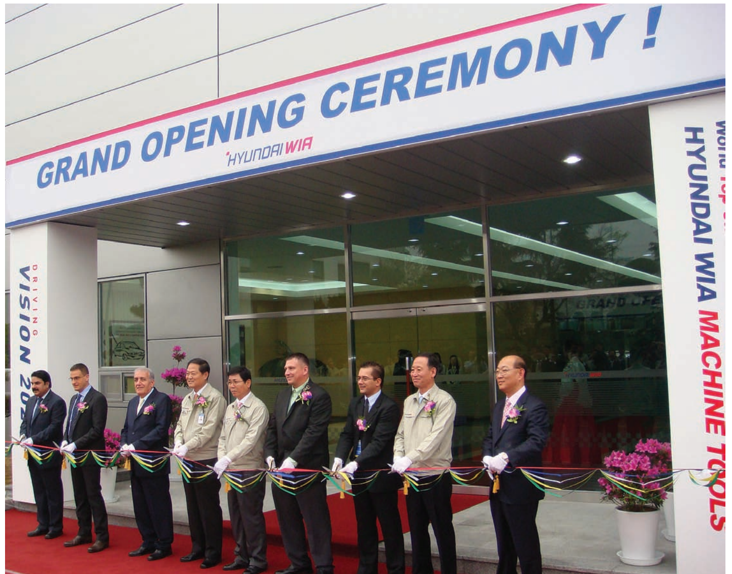
Hyundai Wia celebrates grand opening of new machine tool manufacturing plant expansion with ribbon cutting ceremony.

Hyundai Wia's large booth at SIMTOS 2010, the Seoul International Machine Tool Show, exhibited some of the new machine capabilities now being introduced. Two twin-turret turning machines were introduced and a 5-axis machining center. Hyundai is also focusing on machine tools for large parts and has introduced the KBN135 heavy-duty boring machine. Hyundai robots were exhibited at SIMTOS. Also, a manufacturing cell designed for